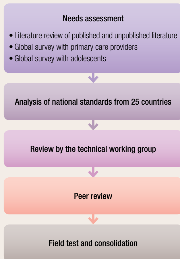
Fig. 1. The process for development of the global standards for quality health-care services for adolescents

WHO developed the global standards based on the needs assessment, which was informed by the literature review and online surveys, in conjunction with the analysis of 26 national standards from 25 countries: Bangladesh, Bhutan, Burkina Faso, Congo, Ethiopia, Ghana, India, Indonesia, Kyrgyzstan, Lesotho, Malawi, Mongolia, Myanmar, Nicaragua, Philippines, Republic of Moldova, South Africa, Sri Lanka, Tajikistan, Thailand, Ukraine, United Kingdom (England, Scotland), United Republic of Tanzania, Viet Nam, and Zambia. The analysis of national standards identified the most common standards 1 and their criteria, 2 which were then reviewed against the findings of the literature review and global surveys. Actions from